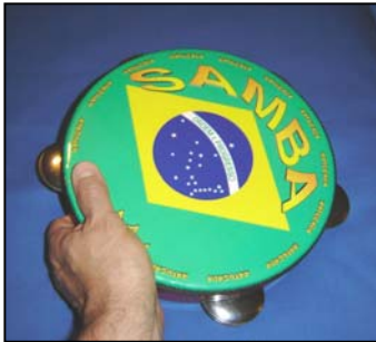
The Flag of Brazil