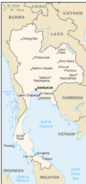
Map of Thailand