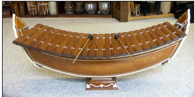
The Ranāt ēk

1. How does the ranāt ēk player sustain notes?